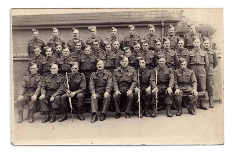
5th County of Lancaster (Preston County) Battalion (Home Guard), A Section, B Company, 1944 (Ref: HG/2/7)